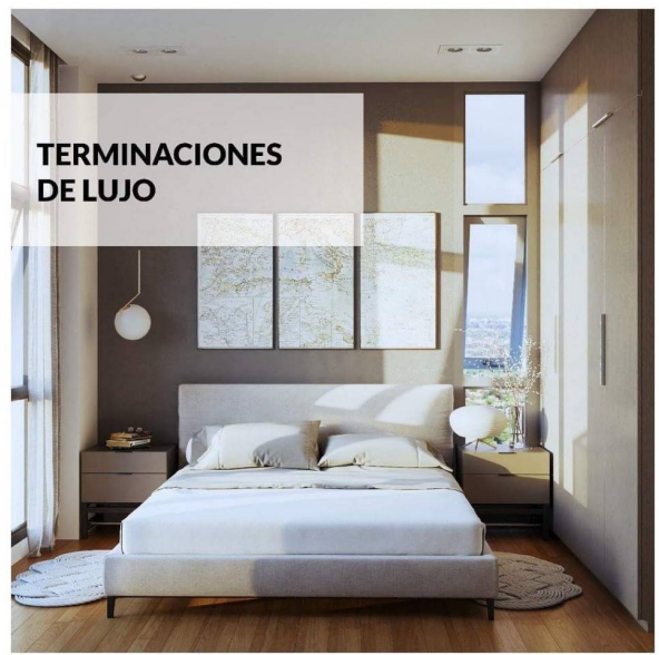
TERMINACIONES DE LUJO