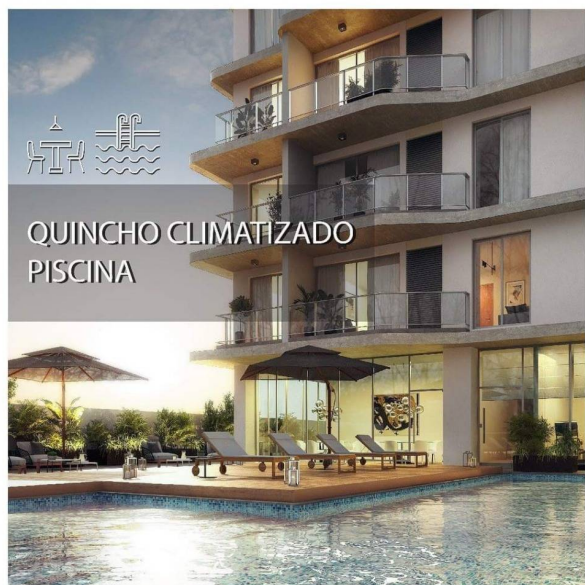
QUINCHO CLIMATIZADO PISCINA